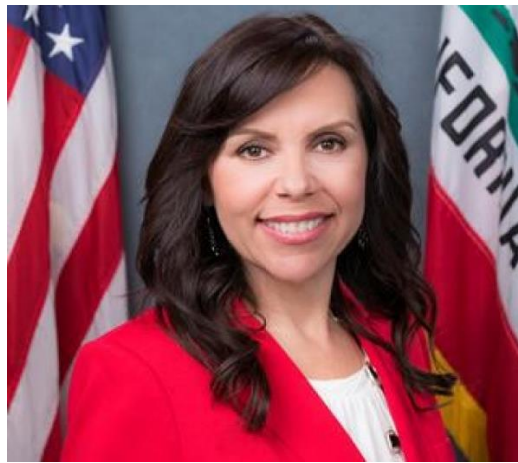
Assemblywoman Blanca Rubio