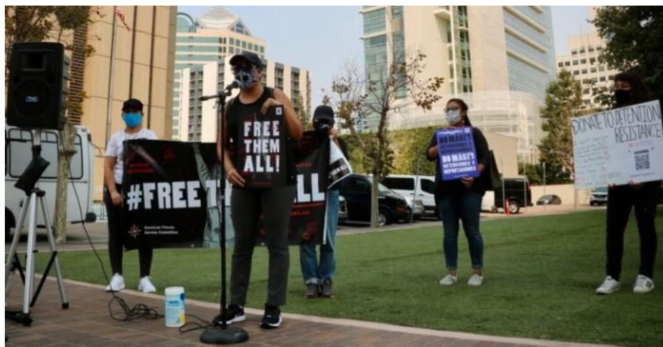
AFSC #FreeThemAll event in San Diego.