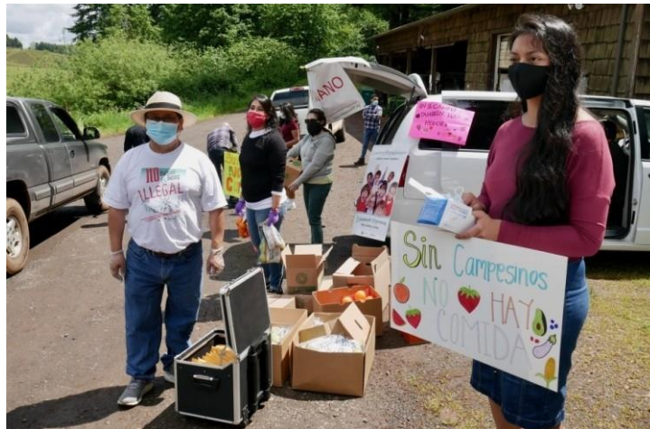
Distributing aid to farmworkers in Oregon.