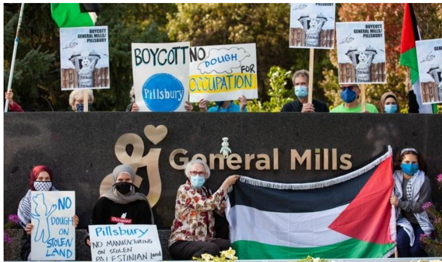
Protesting at General Mills HQ in Minneapolis.

Welcome to the American Friends Service Committee's West Region monthly newsletter. We look forward to connecting with you regarding our shared work for peace and justice. Thanks for your interest and support; please send feedback to WestNews@afsc.org .