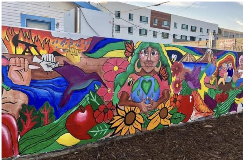
"The New Story" mural by 2018 R4P Farmtternship youth

Welcome to the American Friends Service Committee's West Region monthly newsletter. We look forward to connecting with you regarding our shared work for peace and justice. Thanks for your interest and support. Please send feedback to WestNews@afsc.org .