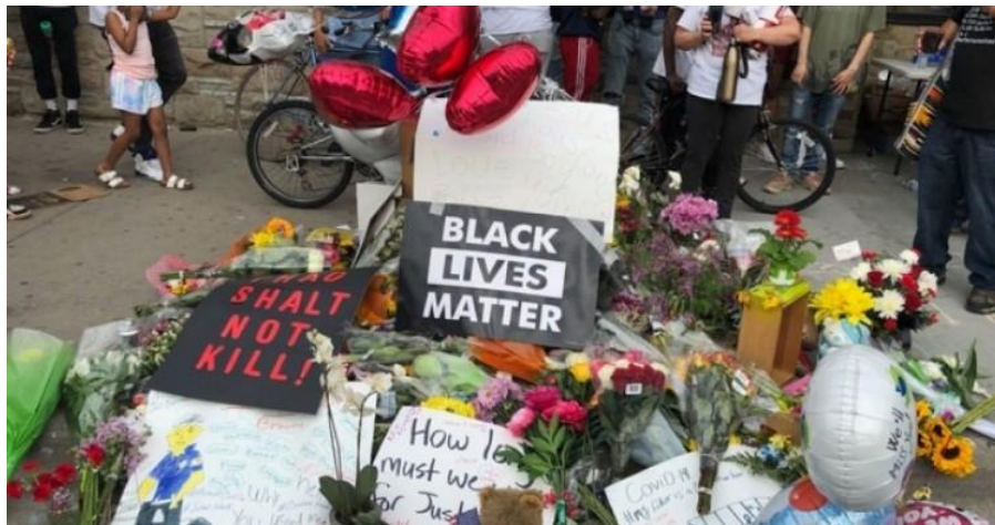
Memorial to George Floyd in Minneapolis

Welcome to the American Friends Service Committee's West Region monthly newsletter. We look forward to connecting with you regarding our shared work for peace and justice. Thanks for your interest and support; please send feedback to WestNews@afsc.org .