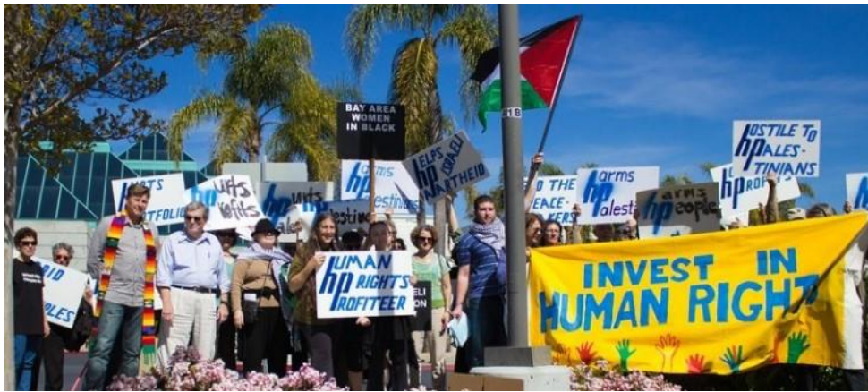
Demonstrating outside an HP shareholder meeting