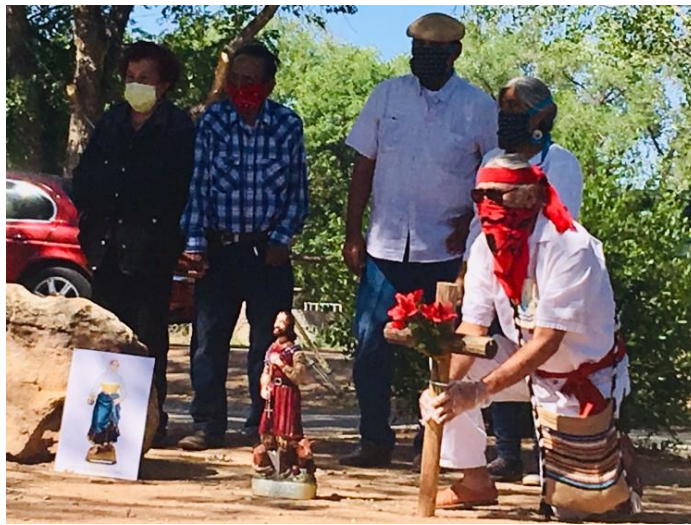
Celebrating San Ysidro Day in New Mexico