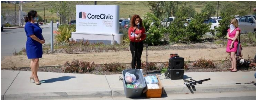
AFSC and partners attempt to deliver 800 facemasks to San Diego's Otay Mesa Detention Center.