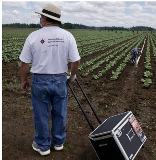
Delivering masks to farmworkers.

67 Sueños is calling for support for our undocumented youth and mixed-status families during COVID-19. During our online sessions (see above), youth have told us about experiencing financial hardships and life difficulties such as unemployment and reduced work hours, food and rent insecurity, and lack of other basic needs. Because our federal government fails to provide undocumented and many mixed-status families with relief, it is important that we stand in solidarity with those who are particularly vulnerable during these times. Please give today , and follow 67 Sueños on Instagram .