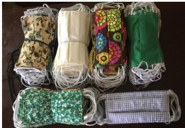
Masks made by Syrian refugees for farmworkers

AFSC's work to accompany land-based people in New Mexico in their struggle for self-determination includes supporting their spiritual and cultural traditions around love of the land and water. For hundreds of years on May 15, people have marked the Feast of San Ysidro Labrador and his wife, Santa Maria de la Cabeza, both patron saints of farmers. This year, in light of the challenges posed by COVID-19, they did what humans so skillfully do: adapt. Learn more about this unique celebration.