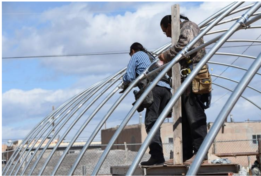
Working in a Pueblo to build a coldframe