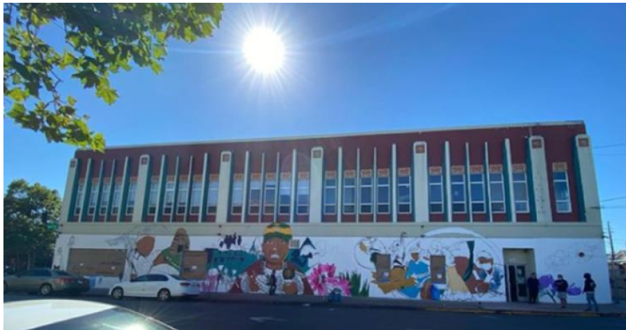
67 Sueños mural in Oakland

AFSC has been a strong supporter of the VISION Act (AB 937), which would ensure that like any other Californian, an immigrant deemed eligible for release from state prison or local jail would not be turned over to ICE detention and instead would be able to reunite with their family and community. This includes a person who has completed their sentence, been granted parole, had charges dropped, or been granted release by a judge. AFSC has joined with dozens of organizations across California to pass it through the Assembly (June 3) and the Senate Public Safety Committee (July 13). As it's gaining new support in the California legislature, it will soon need approval from the Senate Appropriations Committee. This is our commitment to limit the harmful impact of ICE detention for migrant community members and their families, and it's an extension of our #FreeThemAll national campaign.