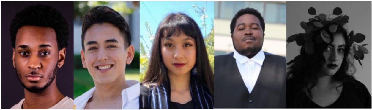
Check out the bios of these new ArteVism Fellows.