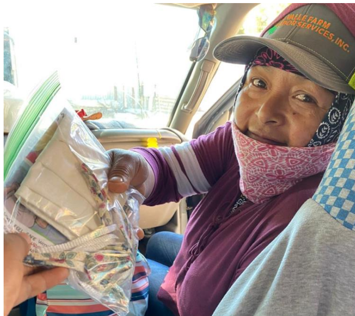
Delivering masks to farmworkers

Welcome to the American Friends Service Committee's West Region monthly newsletter. We look forward to connecting with you regarding our shared work for peace and justice. Thanks for your interest and support; please send feedback to WestNews@afsc.org .