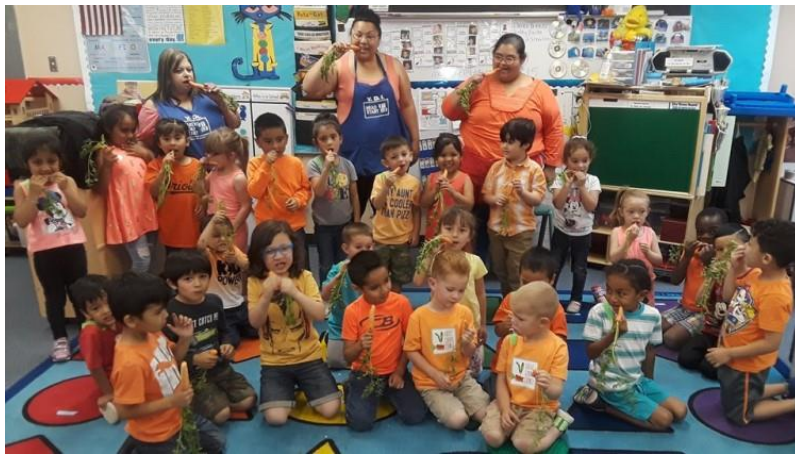
Children crunch carrots in New Mexico.