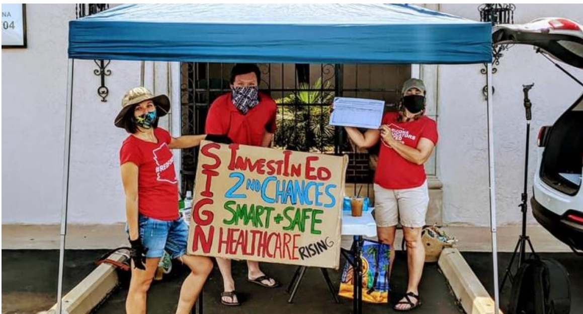
AFSC staff and volunteers collected nearly 400,000 signatures on the Second Chances Act petition.