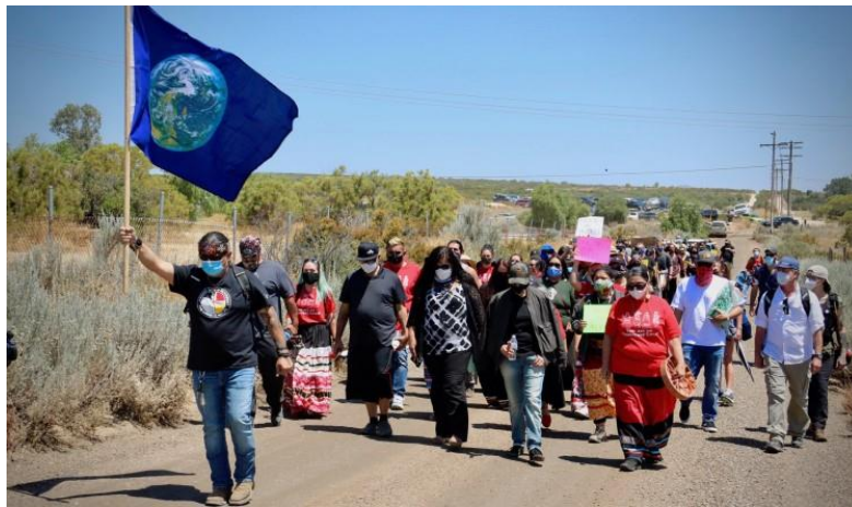
Kumeyaay tribal bands and supporters