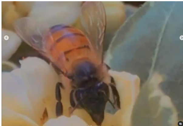
Another pollinator for justice in Los Angeles

“At least since 1987, the United States Border Patrol has operated unsanctioned cover-up units known as Critical Incident Teams,” writes Pedro Rios of AFSC. “These special units have concealed, altered and destroyed evidence to obstruct justice, and now Congress has requested an investigation into them and asked that Customs and Border Protection (CBP), the Border Patrol’s parent agency, turn over documents related to them. But Congress doesn’t have to wait for the documents. It can end these secretive units now and open the door to prosecuting agents who have obstructed justice.” Read more .