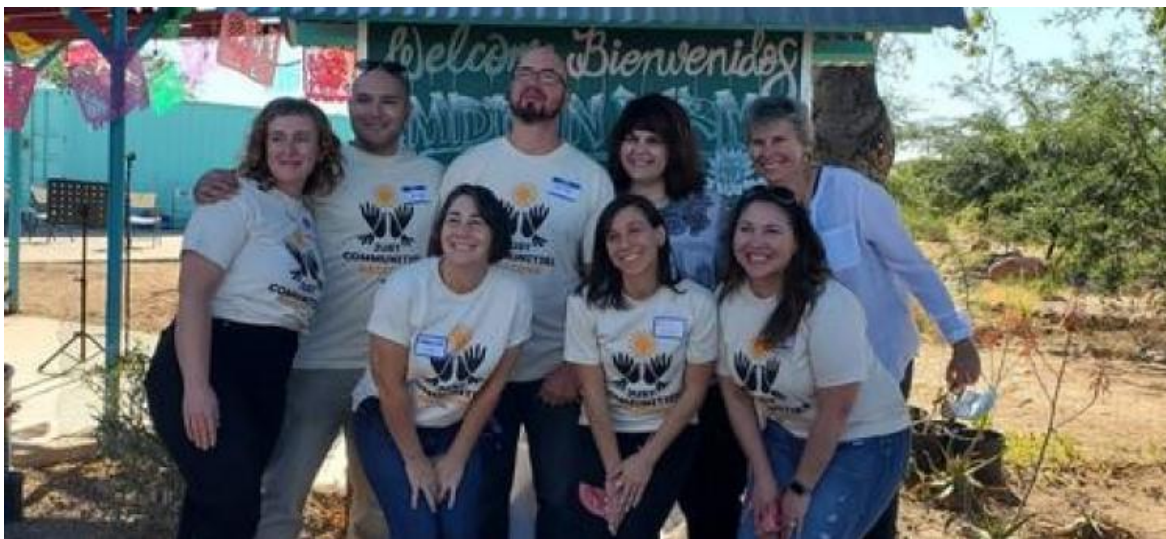
AFSC regional staff celebrate with Just Communities Arizona.