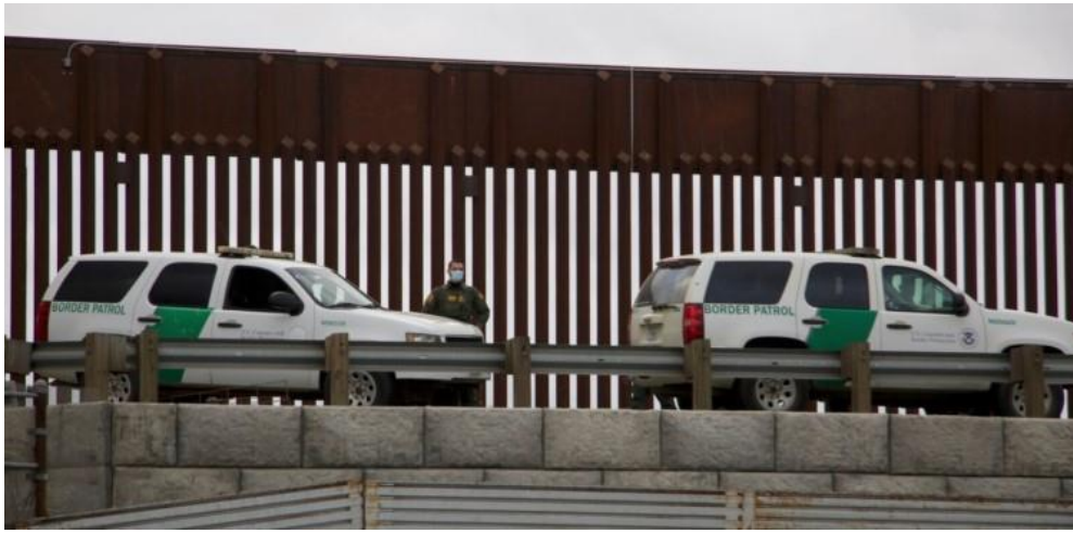
The Border Patrol