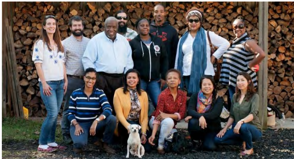
Farming for Social Change Gathering 2017