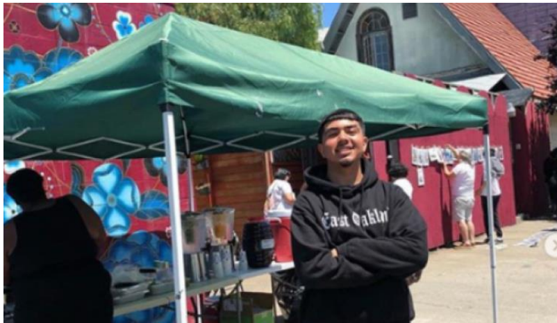
A young person supported by 67 Sueños