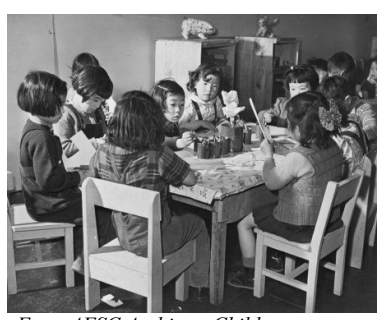
From AFSC Archives: Children are taught democratic games in the nursery school at the Manzanar Relocation Center in California. Photo credit: Francis Stewart, 1944

Next, the US conducted forced removal of Native American children from their homes and parents in the 1800s and 1900s The children were put