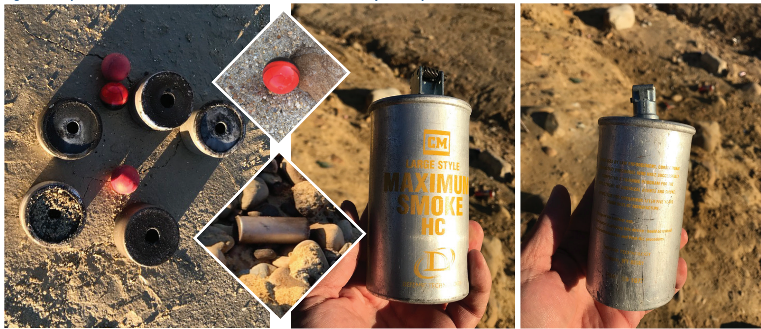
Figure 5: Objects recovered and documented from incident site at Playas de Tijuana.

After the November 25 incident where CBP fired chemical agents at migrants, CBP denied that women and children were present. This time around, the agency recognized children were present, but