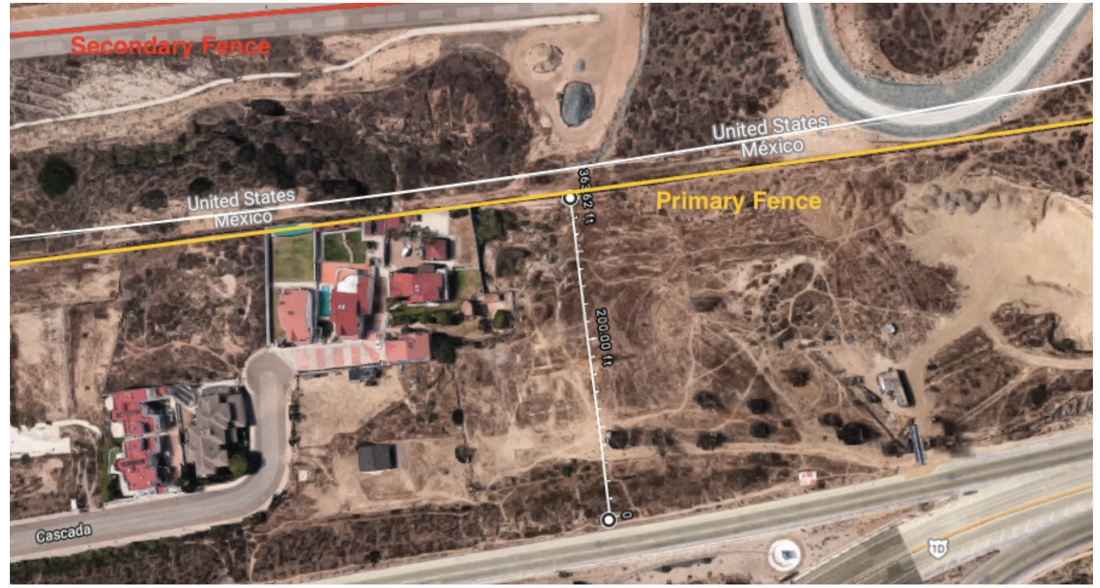
Fig. 1: Construction site area in Playas de Tijuana where Border Patrol officials fired chemical agents at migrants on Dec. 31/ Jan. 1

The first recorded event where CBP deployed chemical agents against migrants took place on November 25 in an area adjacent to the Pedestrian West Port of Entry, known as Chaparral. On that same date, CBP agents fired chemical agents at a location east of the San Ysidro Land Port of Entry. The second recorded event, the focus of this report, took place between the evening hours of December 31, 2018 and early morning hours of January 1, 2019, at a construction site in the community of Playas de Tijuana adjacent to Highway 1D (Tijuana-Ensenada), east of the Paseo de Playas de Tijuana off-ramp (see Fig. 1).