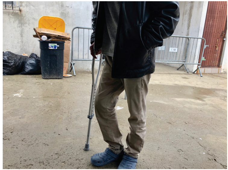
Fig 4: Injured man interviewed on Jan 17, 2019

The minor in the group interviewed was a fifteenyear-old from Honduras. He was at the border wall on the beach area of Playas de Tijuana. He and other minors climbed over the border fence and tried to turn themselves into Border Patrol, but agents told them to climb back over the wall. The minor stated that he and other migrants tried multiple times to