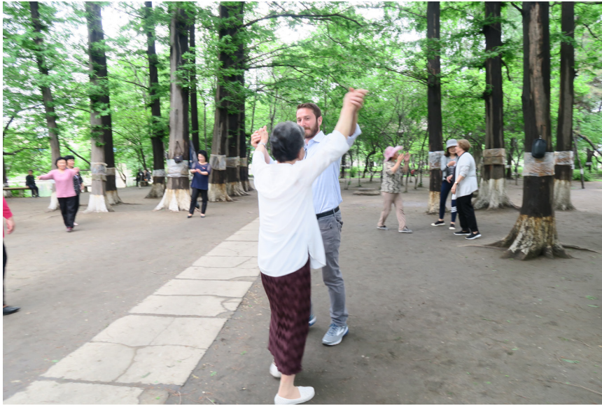
Tourists and aid workers create critical people-to-people connections and have priceless interactions with North Koreans when they visit the DPRK.

Collectively, these 1,200 U.S. citizens either living in or visiting the DPRK before restrictions took effect had hundreds of thousands of interactions with North Koreans annually. The information exchanged and linkages they created had an outsized impact on both communities. In a context where contact is so minimal, these interactions played a vital role.