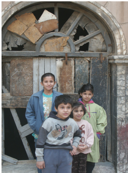
Sanctions against Iraq were responsible for the deaths of over 576,000 children in the 1990s.

Policymakers should heed the words of Madeline Albright, who served as the U.S. ambassador to the UN during the Clinton years, when she stated that sanctions like those used on Iraq, “are a blunt instrument. That’s their tragedy. What was so terrible for me was that I did see the faces of the people