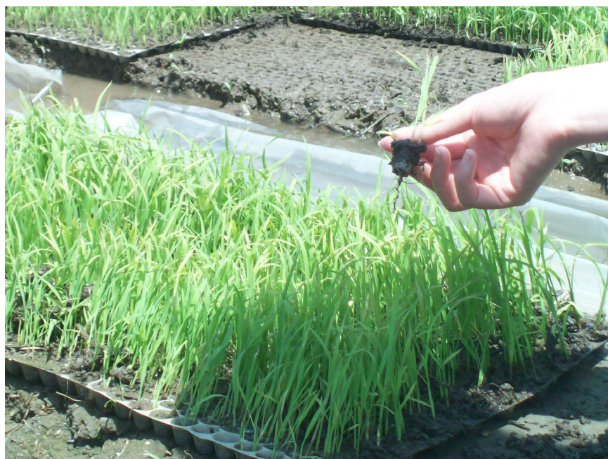
Plastic trays used for rice seedbed cultivation raise yields by 10-15%. AFSC introduced the trays to a delegation of North Korean farm managers in 2007.

Our work today continues to demonstrate the power of building professional and people-to-people linkages. In 2007, AFSC facilitated a delegation of North Korean farm managers to China where participants were introduced to the use of plastic trays for rice seedbed cultivation. Now used in pilot projects at four AFSC partner cooperative farms, the trays increase rice yields by 10-15 percent, directly benefiting at least 3,000 farm families (or over 12,000 individuals). Farmers on an additional 24 farms have been trained by AFSC in use of the trays, benefiting an additional 72,000 North Koreans, and the DPRK government is now promoting the use of this new technology nationwide.