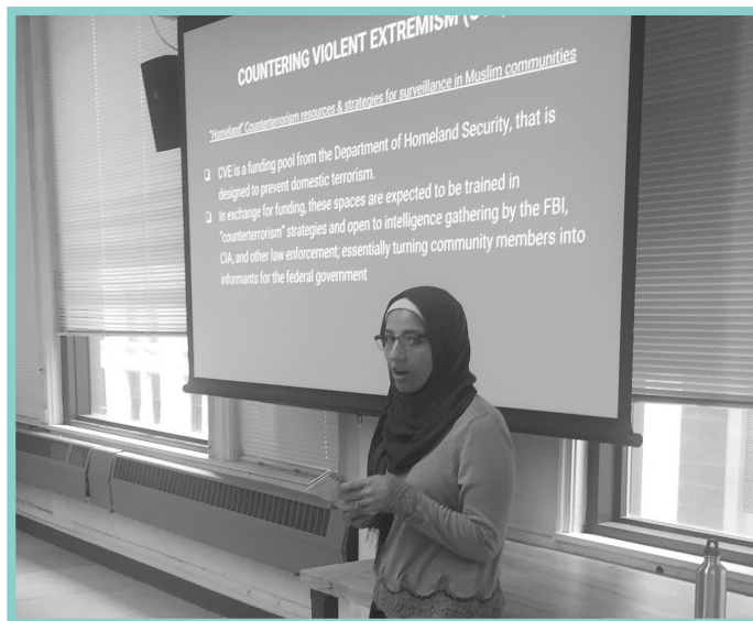
#StopCVE-Chicago workshop with education students