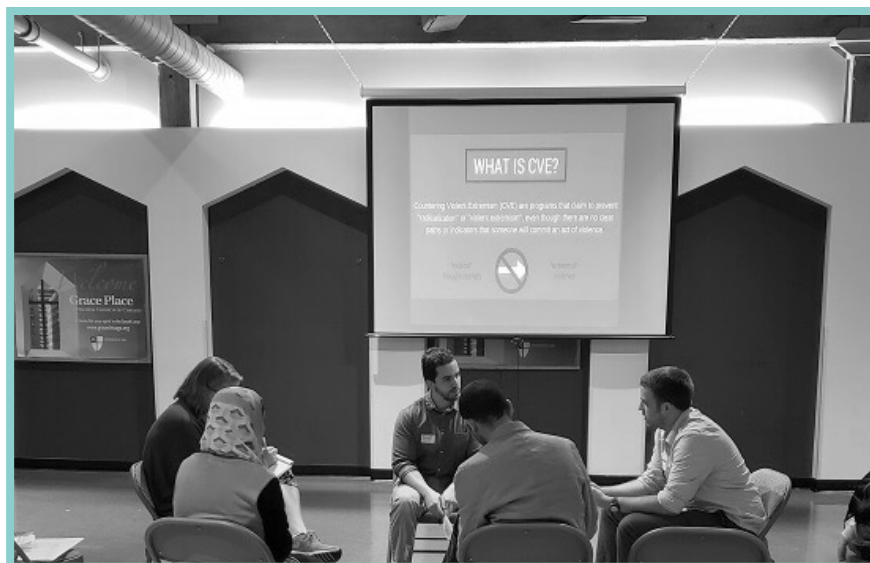
#StopCVE-Chicago workshop legislative break-out group