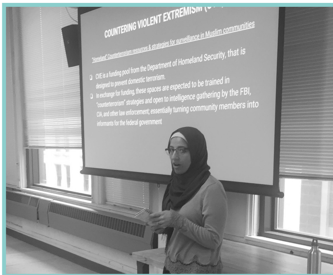
#StopCVE-Chicago workshop with education students