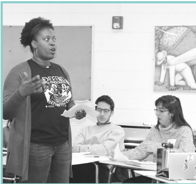
#StopCVE-Chicago workshop at the Teachers for Social Justice Curriculum Fair

The Cook County DHSEM agreed to allow ICJIA to use its previously developed trainings on targeted violence as appropriate in this project. These previously developed training materials were also funded by the U.S. Department of Homeland Security, and this will allow ICJIA to create a more effective training while maximizing the impact of federal funds.