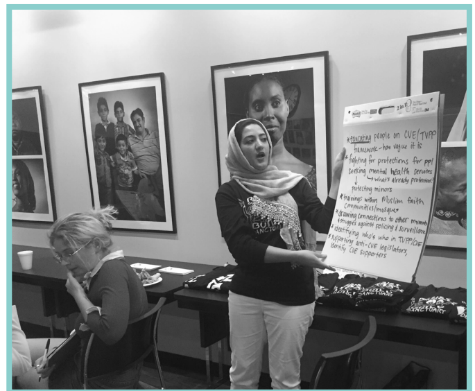
#StopCVE-Chicago teach-in at the Council on American-Islamic Relations