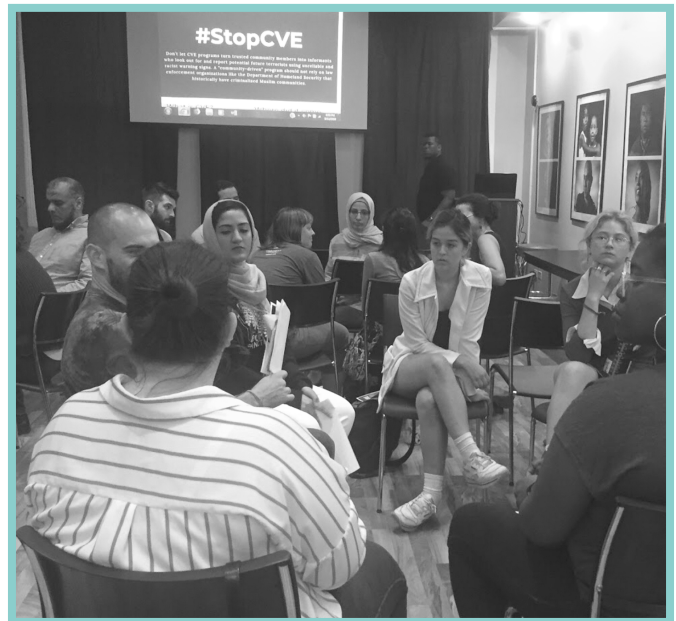
#StopCVE-Chicago teach-in at the Council on American-Islamic Relations