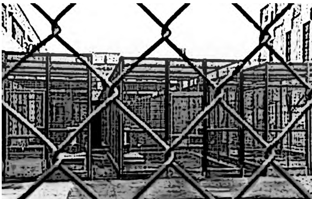
Exercise cages, San Quentin (Artist: Kendal Au)

The total number of people in long-term lock down in California on a given day exceeds 14,600