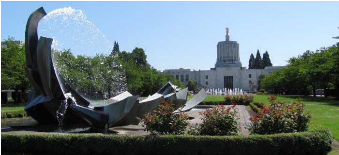
The Oregon State Capitol State Park in Salem