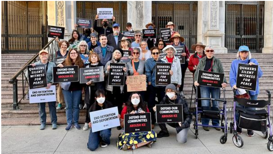
Roots for Peace (RFP) Program, Los Angeles