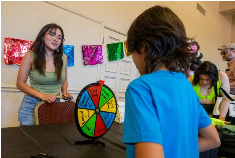
Youth involved with PVI