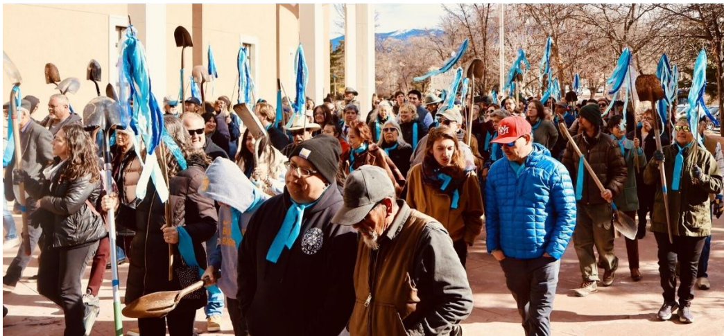
Acequia Day march in Santa Fe