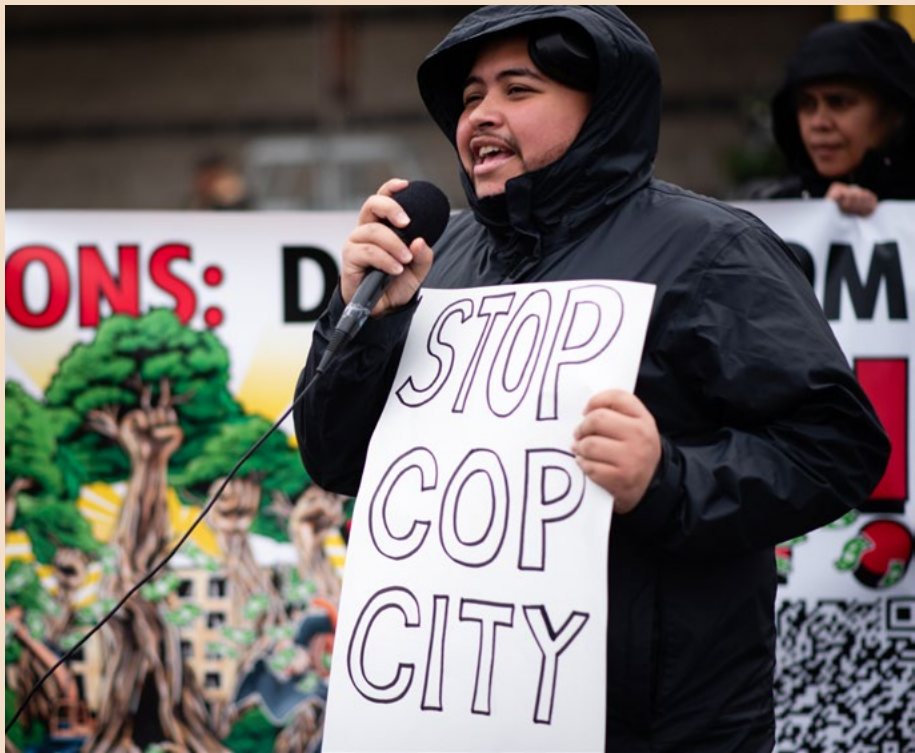
A Stop Cop City protest in front of Home Depot in Emeryville, California.

Since 2021, the Stop Cop City coalition in Atlanta, which includes AFSC, has worked to halt the construction of a massive, militarized police training facility, known as “Cop City.” If built, Cop City would train law enforcement from all over the world in repressive tactics, often used on protesters and communities of color.