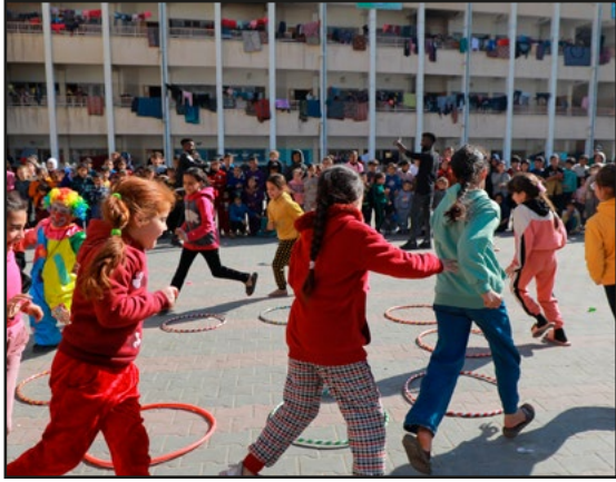
(Top): AFSC efforts to provide drinking water to displaced people in Rafah. (Bottom): Children enjoying recreational activities organized by AFSC and partners.