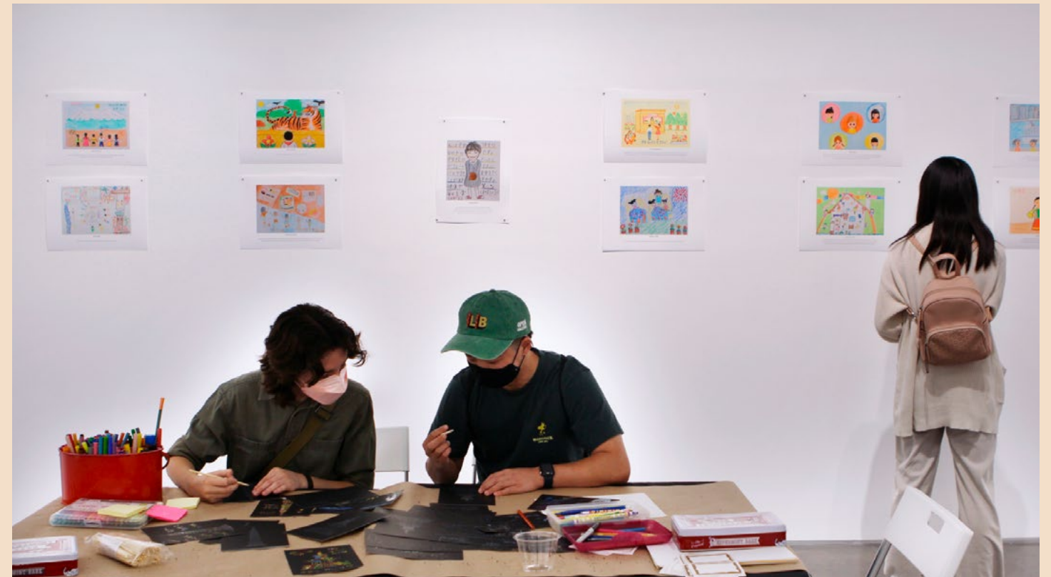
“Drawing Hope” exhibit in Los Angeles.