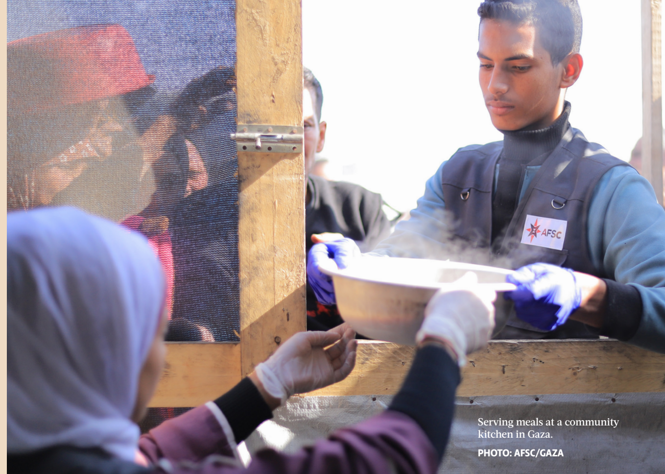
Serving meals at a community kitchen in Gaza.

Around the world, AFSC joins with communities to plant the seeds of peace. Together, we defend human rights, protect civic space, and demand dignity for all.