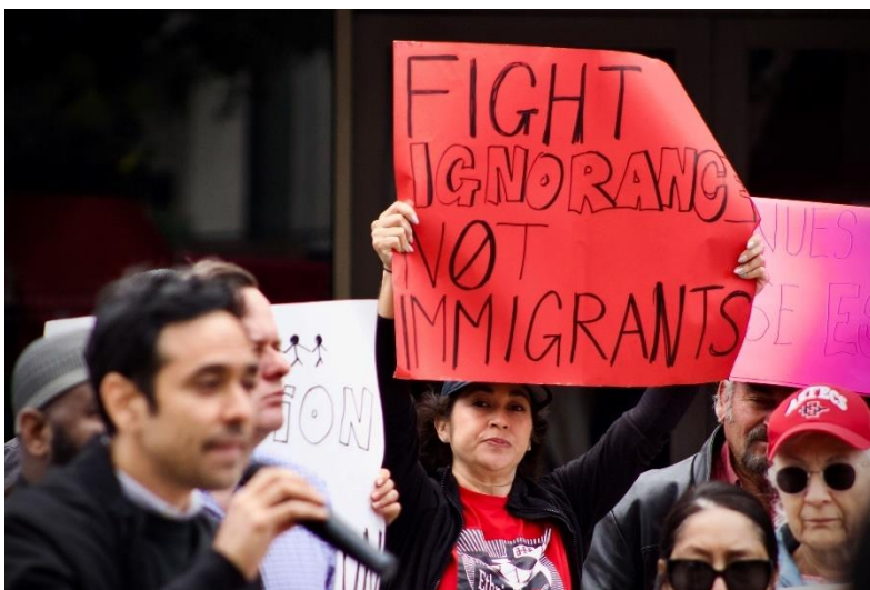
At a press conference denouncing the El Cajon workplace raid

Colorado interfaith leaders and supporters held a press conference on April 16 to publicly release the Faith Leader Statement: Truths About Immigration . Over 230 interfaith leaders across Colorado -- compelled to speak and promote the truth and counter dehumanizing falsehoods that lead to and foster prejudice, injustice, and oppression within our communities--signed the joint statement proclaiming truths about immigration.