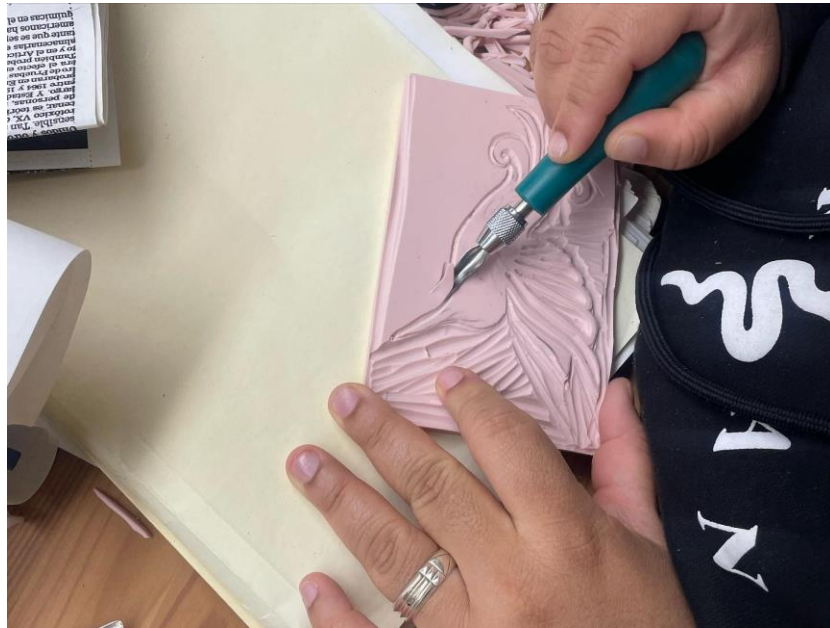
A youth works on a lino block print.