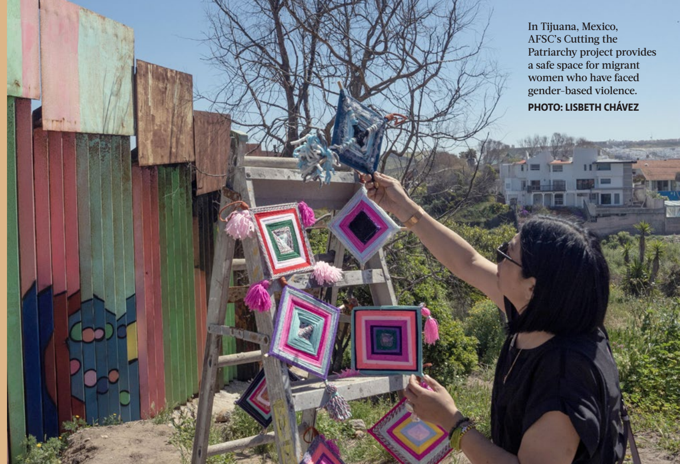
In Tijuana, Mexico, AFSC's Cutting the Patriarchy project provides a safe space for migrant women who have faced gender-based violence.