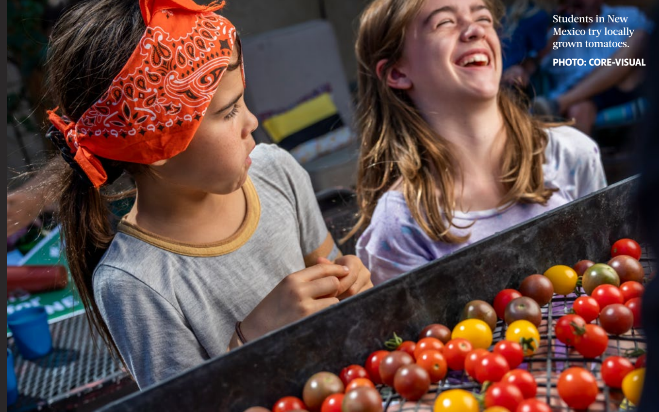
Students in New Mexico try locally grown tomatoes.

SEE MORE STORIES afsc.org/JustEconomies23