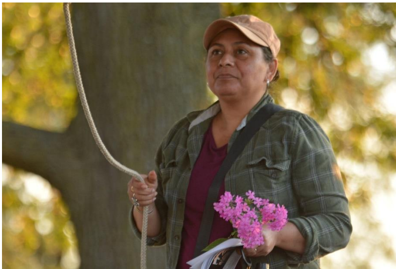
Preparing to ring the Japanese Bell in Des Moines