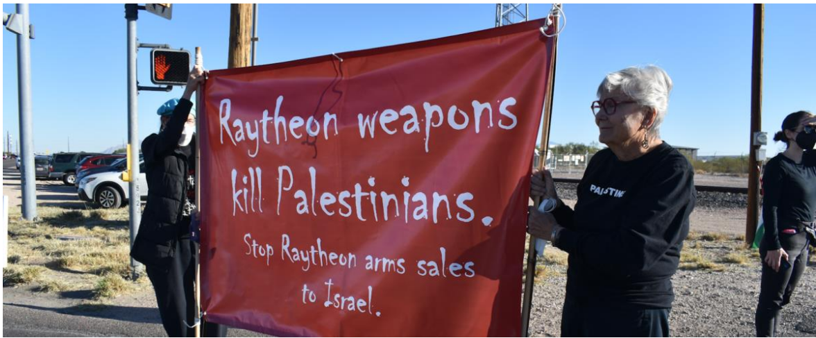
AFSC alum Lois Mastrangelo holds a banner reading “ Raytheon weapons kill Palestinians: Stop Raytheon arms sales to Israel. ”