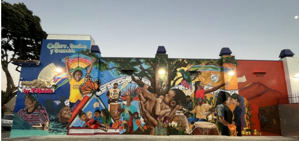
67 Sueños, Oakland

The Border Patrol in San Diego is holding asylum-seeking migrants at makeshift open-air detention sites for hours, and sometimes days, in at least three areas west of the San Ysidro Port-of-Entry between a set of 30-ft border walls. Migrants are in the US but are forced to wait for Border Patrol to pick them up for processing in an area where there are no services. Here is a short report from Pedro Rios describing some of the work AFSC and partners have done over the past several weeks in support of people migrating.