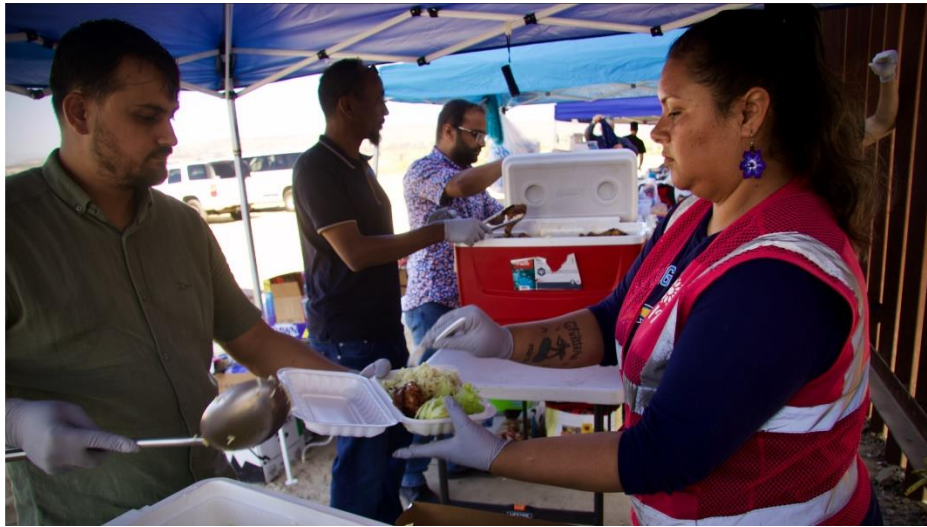
US-Mexico Border Program, San Diego