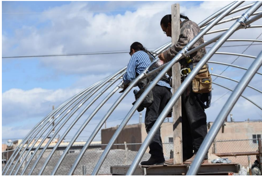
Building a cold frame - Photo: Patrick Jaramillo