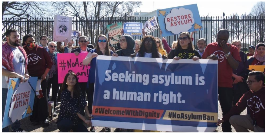
US-Mexico Border Program, San Diego