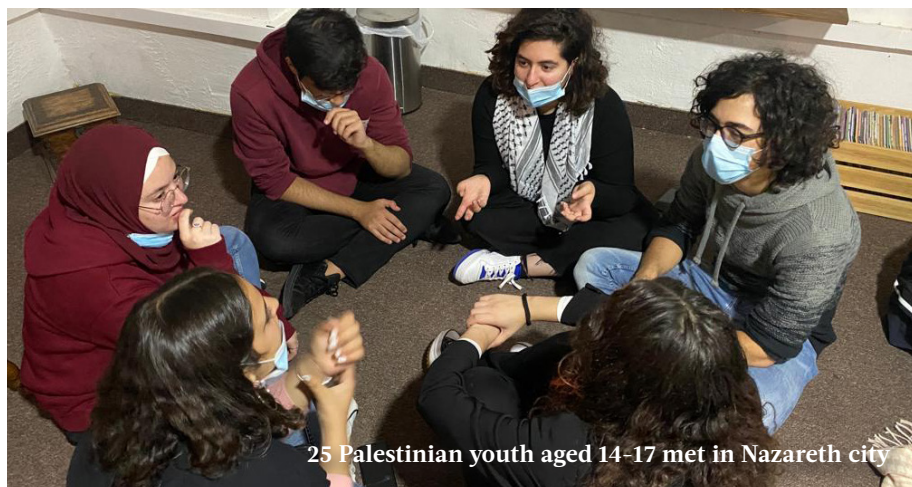
25 Palestinian youth aged 14-17 met in Nazareth city

Now we are working to bring these activities to youth beyond the borders of Gaza, the West Bank, and Israel. Young adults (ages 14-25) from Palestine, Jordan, Lebanon, and the United States will be engaged