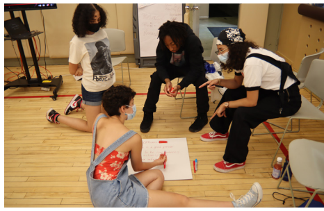
Above: Youth work together during the 2022 Liberation Summer Camp.