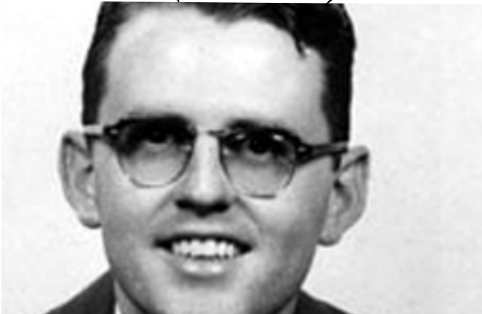
Reverend James Reeb

A social worker and Unitarian Universalist minister, Reverend James Reeb (1927-1965) was severely beaten by a group of white men in Selma on March 9, 1965. Reeb died of head trauma two days later in a Birmingham hospital.