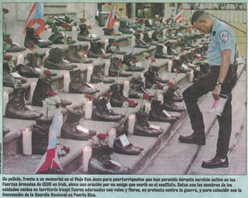
Tributo a soldados boricuas

This is a good rule to follow if you are asked a question that either strays from the subject or you feel uncomfortable answering. Use "bridging" comments such as: "I'm not sure about that. But what I do know is..." or "What is really important about this is..."