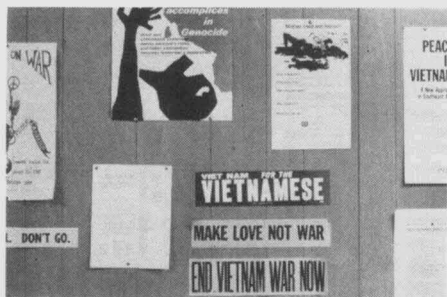
Shouting posters arrest the attention of visitors.

These demonstrations have opened doors to the students and to student newspapers. The Baltimore office intends to leaflet again, taking pains to follow up all opportunities that open for dialogue and information. This is peace education.