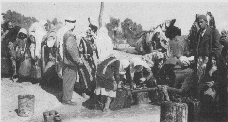
War in the Middle East—again. A three-man exploratory mission visited the area in June and July to assess needs and discuss possible roles for the AFSC. Although details are still being worked out, there will be programs in Jerusalem, the Gaza Strip, and in Amman, Jordan. The photograph, taken in 1948, shows refugee women and children at Rafah, in the Gaza Strip, lined up for water. The AFSC administered relief for the United Nations to 250,000 refugees in the Gaza Strip.