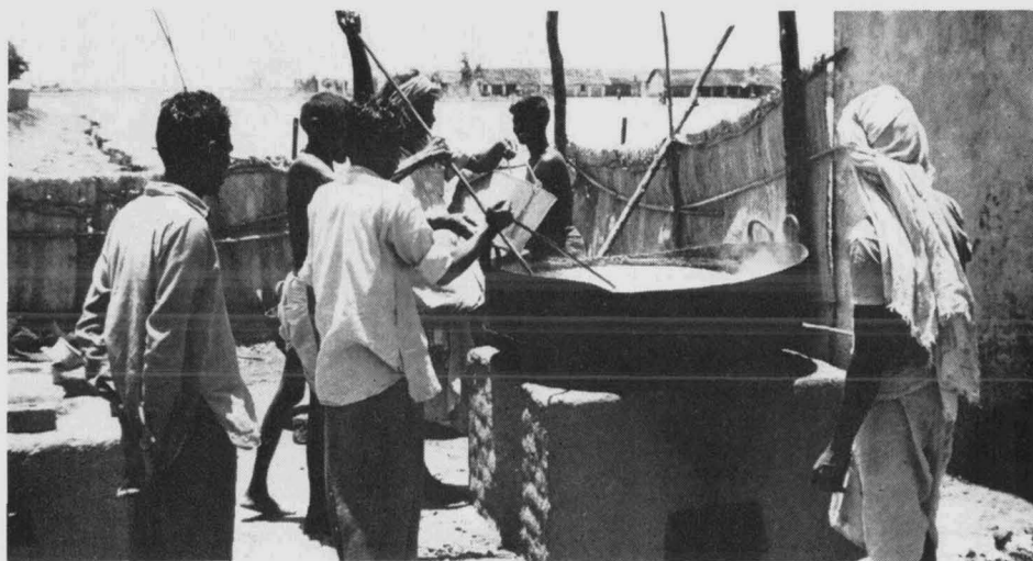
Bihar, India—this free kitchen run by the Bihar Relief Committee is one of about a thousand which, with other food distribution activities, prevented wide-spread starvation this summer. An AFSC mission found that state and national governments in India were cooperating effectively with other governments and private agencies to fight off famine, and contributed $8,000 toward improvements in irrigation.

In another case a Negro attempted to buy a house in a development advertising FHA and VA financing. In spite of the assistance of Service Committee staff members, who met with officials of the FHA and VA, it was necessary to make 69 telephone calls, attend 13 meetings, write 10 letters and obtain the services of a lawyer before he could buy a house in the development.