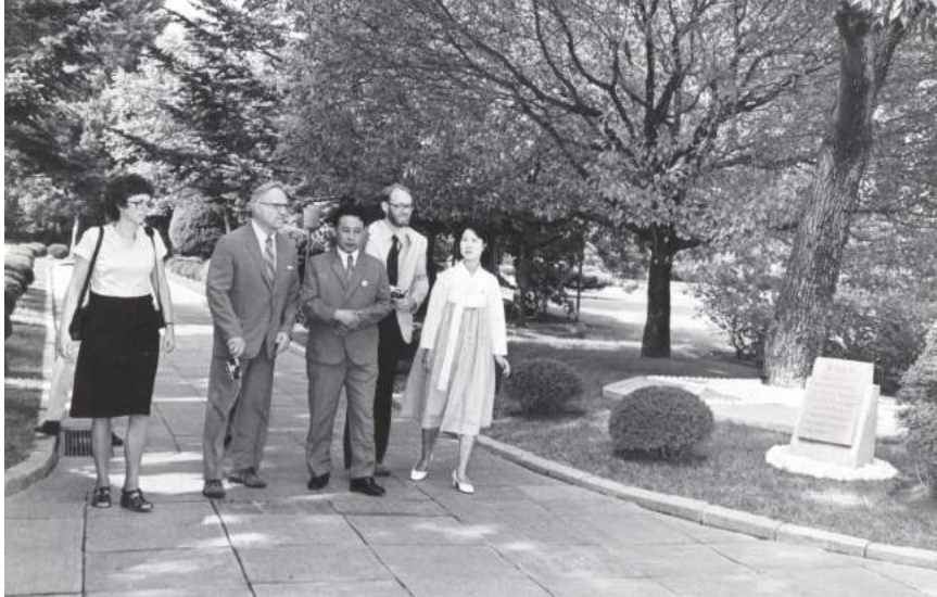
Pyongyang, DPRK, 1980: The first exchange between a U.S. Public Affairs organization (AFSC) and a North Korean organization (KCSWP) allowed for moments critical to relationship-building and only achievable during face-to-face interactions.