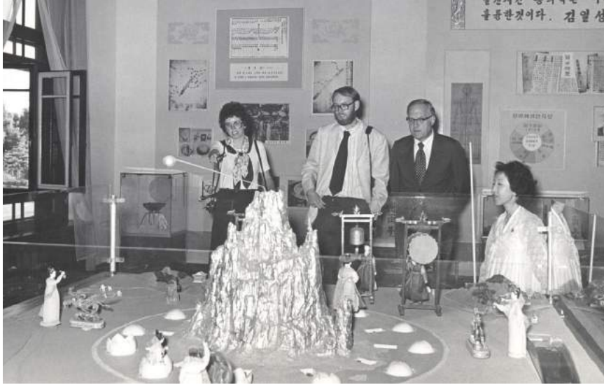
Pyongyang, DPRK, 1980: The first exchange between a U.S. Public Affairs organization (AFSC) and a North Korean organization (KCSWP) involved discussions on many topics and allowed for a more robust relationship and understanding.