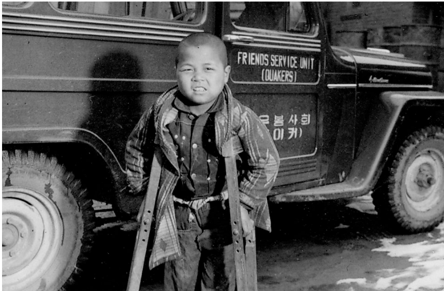
Kunsan, South Korea, 1953: A displaced Korean child stands in front of a Friends Service Unit vehicle.