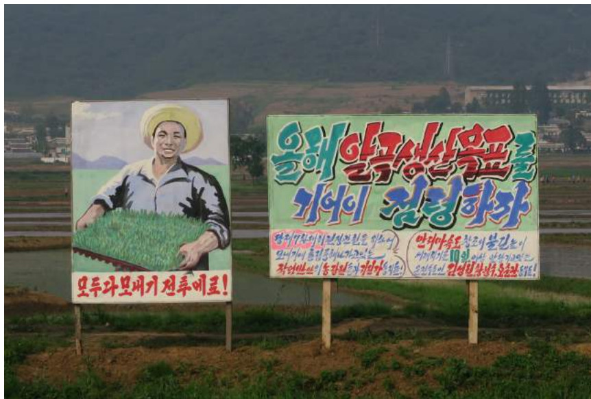
DPRK, 2016: A man holds a plastic tray on a roadside billboard in the DPRK. Trays were first introduced to AFSC's partners in 2007.

AFSC's history and work with KCSWP is perhaps the most continuous example of a successful relationship between U.S. and North Korean organizations. The partnership has been at the forefront of identifying some of the most urgent human needs in the DPRK and has helped to address those needs despite political turmoil and tense international relations. Lessons learned from AFSC's archival documents and ongoing program offer abundant evidence that human needs lie at the heart of global security, as these issues can often be addressed despite political impasses and offer means of engagement that may precede diplomatic breakthroughs.