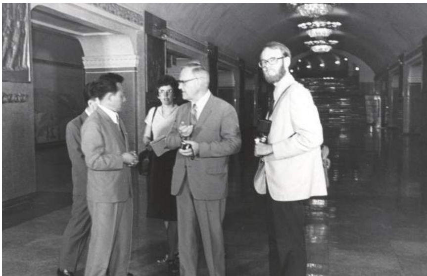
Pyongyang, DPRK, 1980: AFSC staff meet with their North Korean hosts on the first U.S. public affairs delegation to the DPRK.