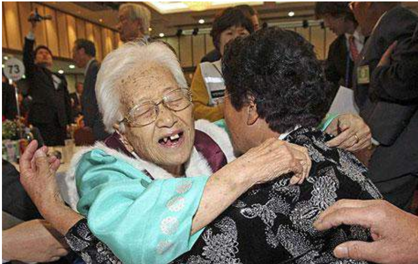
A Korean family reunites.

Under international humanitarian law and under Article 26 of the Fourth Geneva Convention of 1949, the U.S. is obligated to “facilitate enquiries made by members of families dispersed owing war.” The U.S. is also a signatory to Additional Protocol I of the Geneva Conventions, which stipulates under Article 74 that “the Parties to the conflict shall facilitate in every possible way the reunion of families separated.” Despite these obligations, most families in the U.S. have not been able to reunite or exchange correspondence with loved ones in the DPRK. 11