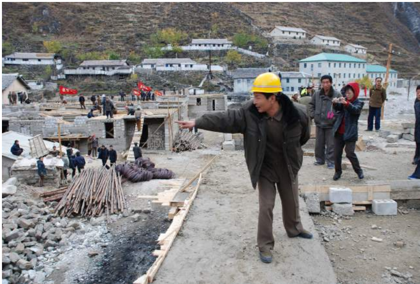
Floods in the late summer of 2012 devastated South Hamgyong province in the DPRK leaving over 62,000 families homeless.

Even when programs are funded, it is well-known among the humanitarian community that, although aid is exempt from U.S. and U.N. sanctions regulations, increased U.N. sanctions on the DPRK have created obstacles and practical problems for the international assistance community working there. Since 2013 banking channels have been disrupted, and tightened financial restrictions after the fourth nuclear test earlier this year have made money transfers into the DPRK extremely difficult. Agencies are unable to get cash into the country, making it hard to deliver much-needed aid.