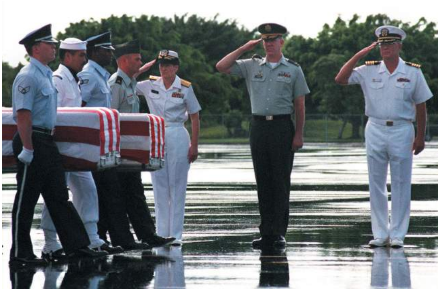
Repatriation ceremony.

After the signing of the armistice agreement and the cessation of hostilities, the U.S. estimated that over 8,000 U.S. servicemen were missing. Most were presumed dead after suffering one of the many possible fates soldiers are exposed to in combat. While initially the U.S. pursued the whereabouts of the missing servicemen, the Cold War prevented any meaningful exchanges in knowledge or cooperation on the matter.