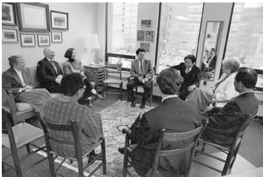
Philadelphia, 1995: AFSC leadership host a KCSWP delegation to exchange thoughts on international relations, human needs, and furthering dialogue between the U.S. and DPRK.