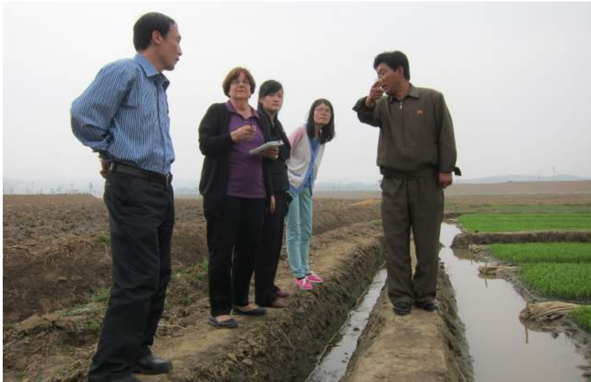
DPRK, 2013: AFSC and KCSWP cooperate to implement conservation agricultural techniques.