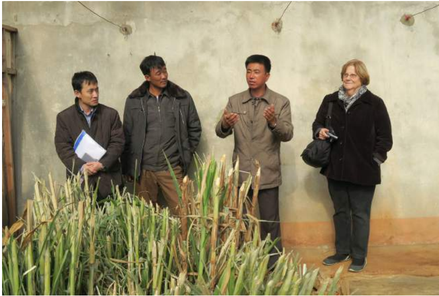
DPRK: AFSC visits a cooperative farm with KCSWP.

The success of AFSC's current projects is due in part to the strength of partnership it has built working with KCSWP for 37 years, as well as the trust built sharing pragmatic, sustainable agricultural practices that are field-tested on partner co-operative farms. Examples of successful contributions to agricultural security by AFSC's program include a project on greenhouse management and a project on rice seedling cultivation in plastic trays.