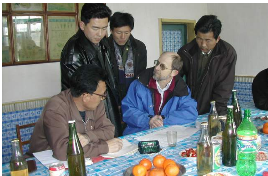
AFSC and KCSWP have carried out exchanges from 1980 to present day. The partnership is one of the oldest between a U.S. and a North Korean organization.