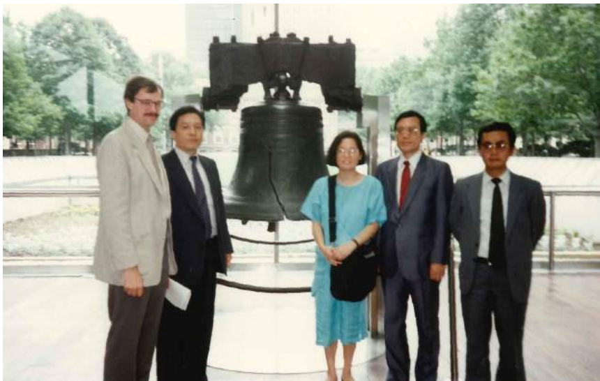
Philadelphia, 1990: AFSC hosts a North Korean delegation in the U.S.