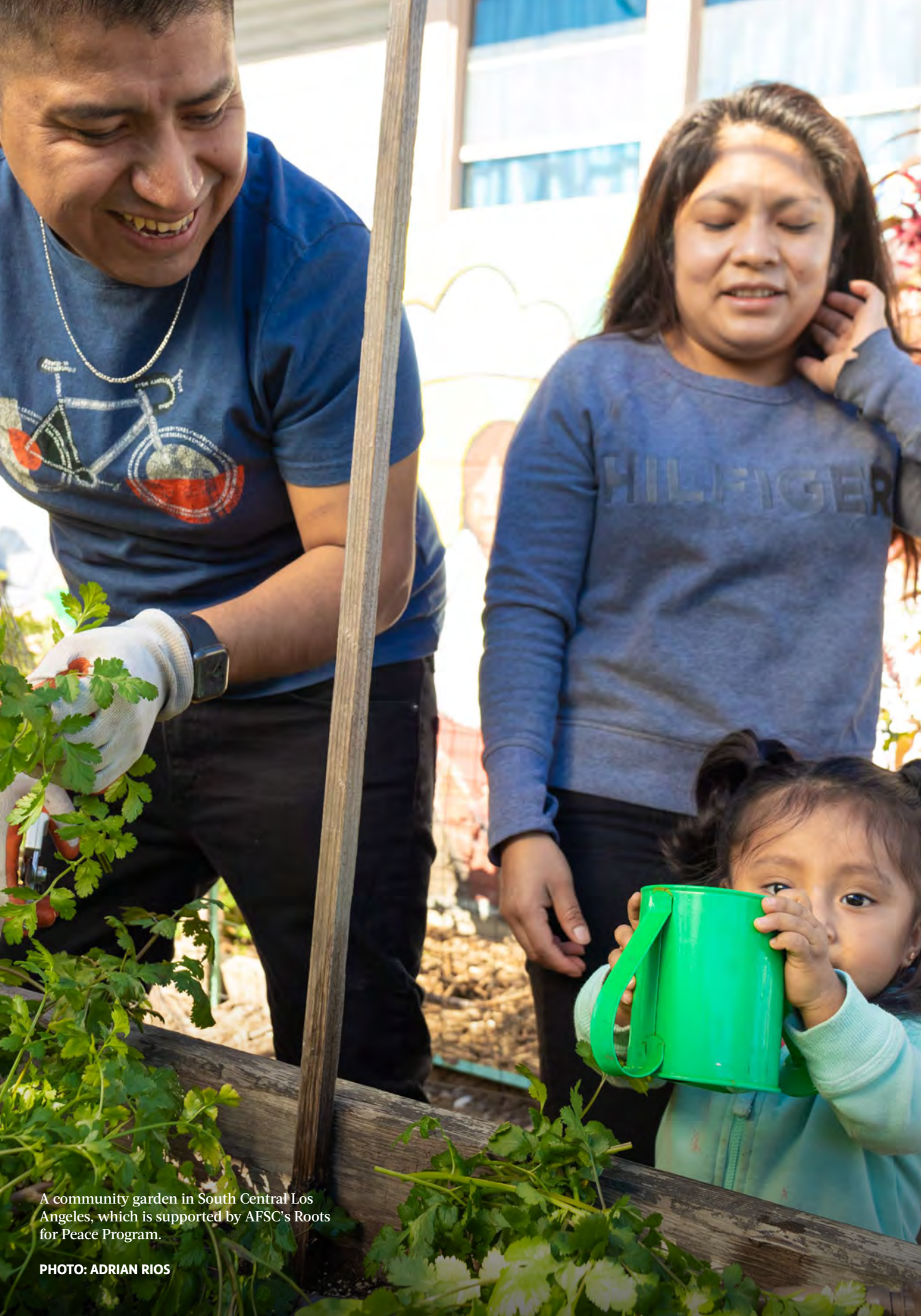
A community garden in South Central Los Angeles, which is supported by AFSC's Roots for Peace Program.