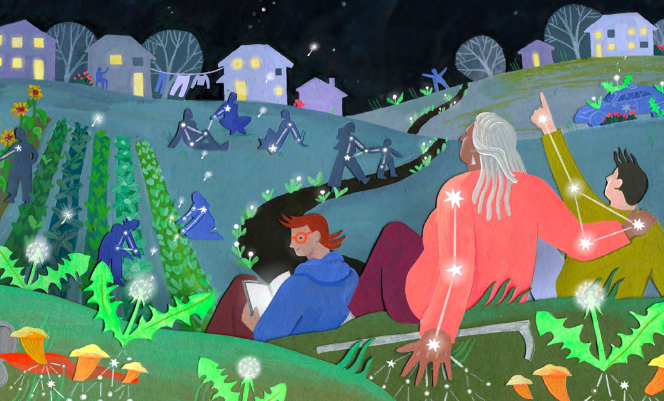
ILLUSTRATION: MOLLY COSTELLO