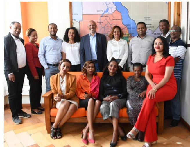
From left to right: BfdW Horn of Africa Regional Office Staff at BfdW HoA Regional Office, Addis Ababa, January 2023