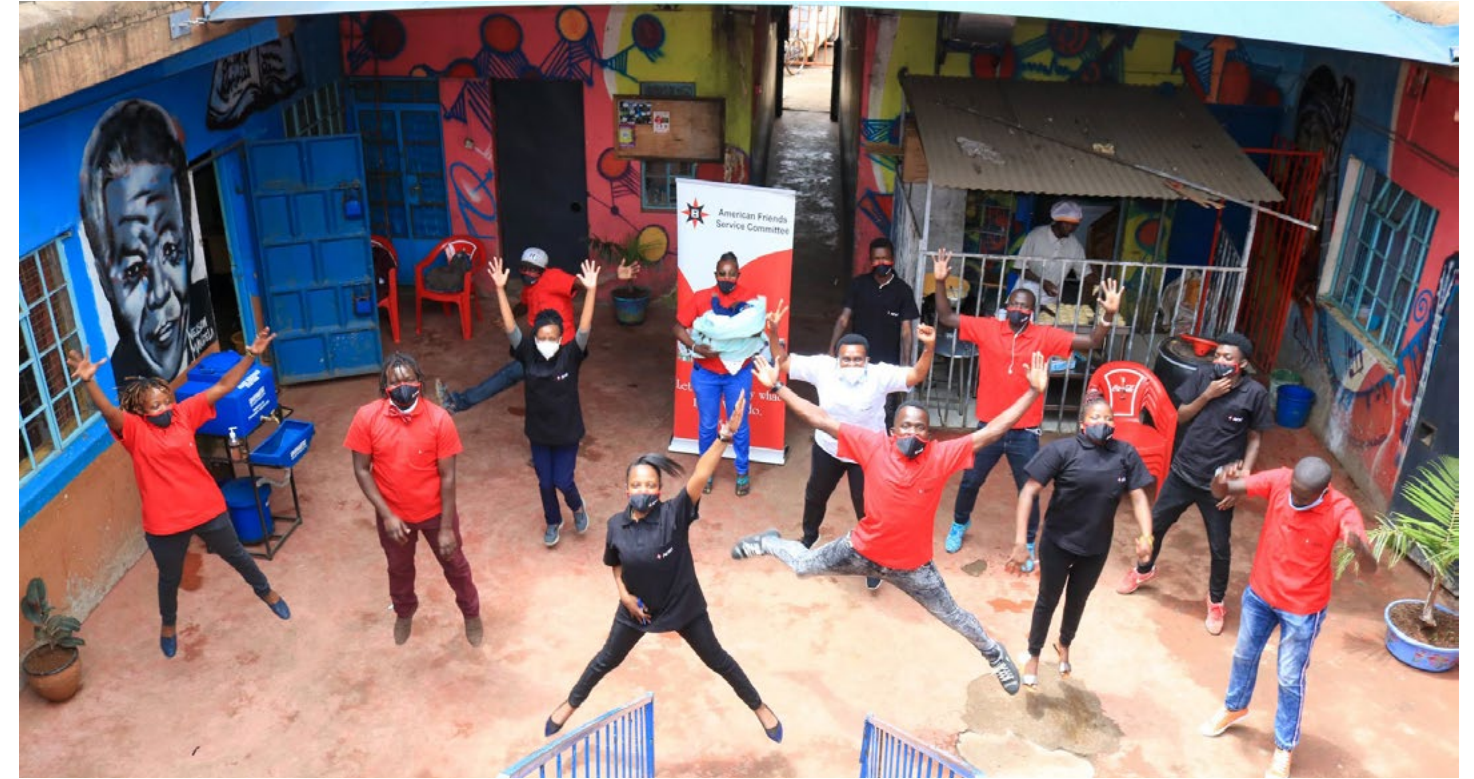
Staff and community members participating in COVID-19 response from AFSC DEP support in Mathare, an informal settlement in Kenya, September 2020.