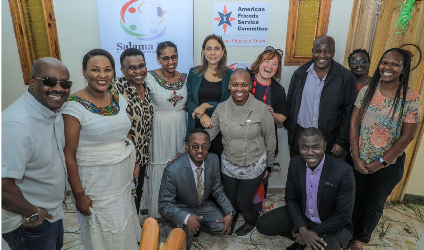
TOP: The Opening of the AFSC Salama Hub Office in Addis Ababa, Ethiopia, by the AFSC General Secretary, Joyce Ajlouny. November 2022. BOTTOM: Launch of the Salama Hub Project in Addis Ababa, Ethiopia, a consortium between AFSC, AACC and BfdW. Representatives of all the organizations following on with the launch activities in the hall.