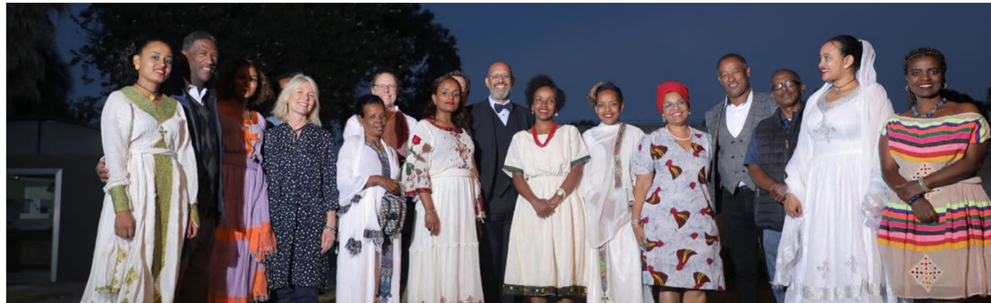
Photo: BfdW Horn of Africa Regional Office Staff, Addis Ababa, Nov 2022