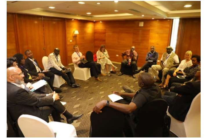
BfdW Partner round table, Addis Ababa, November 2022